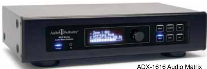
ADX-1616 Audio Matrix