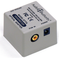
977T coaxial input

When audio components cannot be connected digitally to one another because the manufacturers use different input/output formats (TosLink™/optical or coax), Audio Authority's Model 977 Series solves the problem. By allowing you to convert even the highest bit rate digital signals from coax to optical or vice versa, Audio Authority's digital audio converters provide maximum fidelity and compatability.