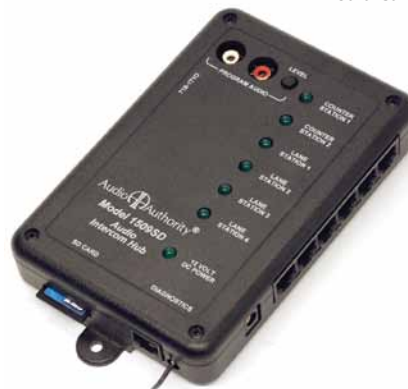
Model 1509SD Audio Hub 4 x 7.75 x 1.25 (WxHxD, inches)