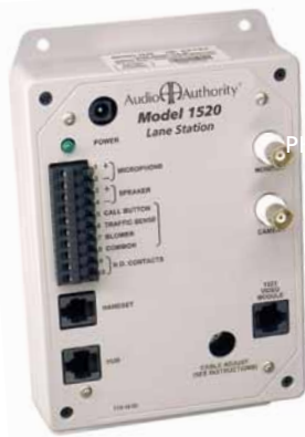
Model 1520 Lane Station 4.75 x 7.25 x 2 (WxHxD, inches)