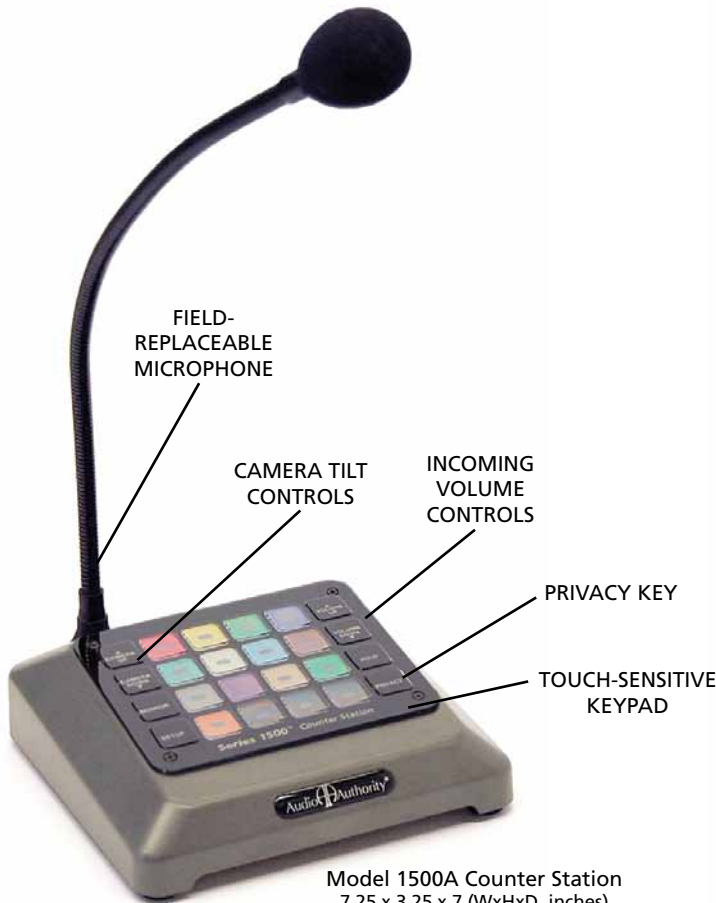
Model 1500A Counter Station 7.25 x 3.25 x 7 (WxHxD, inches)