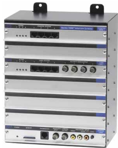
Model 1510 A/V Hub (Basic Configuration) 9 x 12 x 6 (WxHxD, inches)