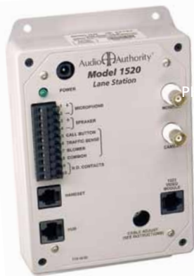
Model 1520 Lane Station 4.75 x 7.25 x 2 (WxHxD, inches)