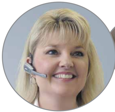
WIRELESS HEADSET (PLANTRONICS® CS55 SHOWN)