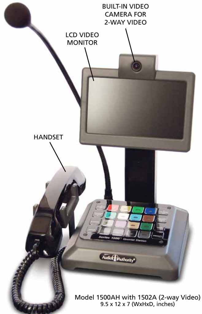
Model 1500AH with 1502A (2-way Video) 9.5 x 12 x 7 (WxHxD, inches)