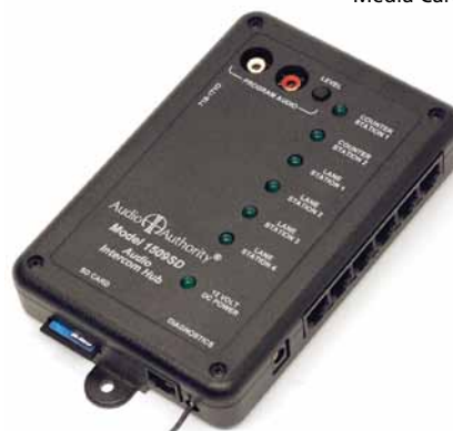
Model 1509SD Audio Hub 4 x 7.75 x 1.25 (WxHxD, inches)