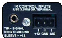
Standard 3.5mm IR jack or terminal connection.