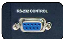
RS-232 for standard serial control.