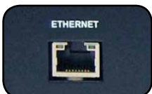
Ethernet control via PC or other IP control system.

Virtually any control system or programmable remote can take full advantage of audio switching, EQ settings, zone grouping, lockout and more. Basic functions of the ADX Series Audio Switchers can be controlled with IR via 3.5mm and terminal connectors or via the IR receiver on the front.