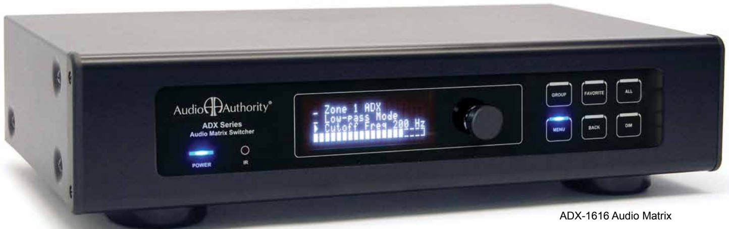
ADX-1616 Audio Matrix