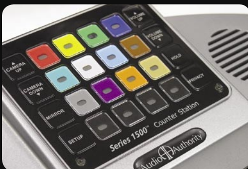
Model 1500 Audio Counter Station