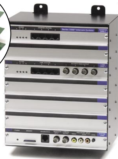
MODEL 1510 (Basic Configuration) 9" W x 12" H x 6" D