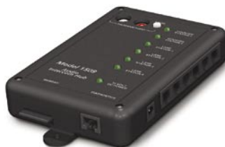
MODEL 1509 4" W x 7 3/4" H x 1 1/4" D