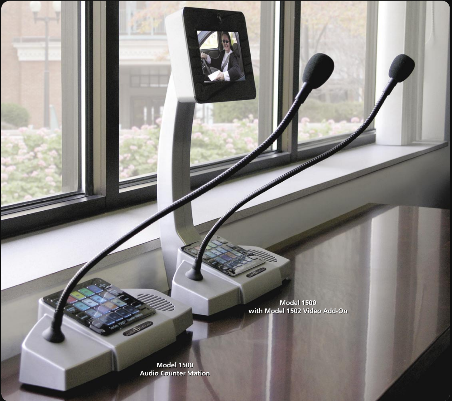
Model 1500 with Model 1502 Video Add-On