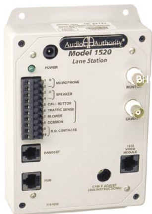
MODEL 1520 4 3/4" W x 7 1/4" H x 2" D

Volume levels and system configuration are easily set from one of the Counter Stations, and are stored on a flash memory card – there are no tricky adjustment potentiometers or DIP switches to set in the 1500 system.