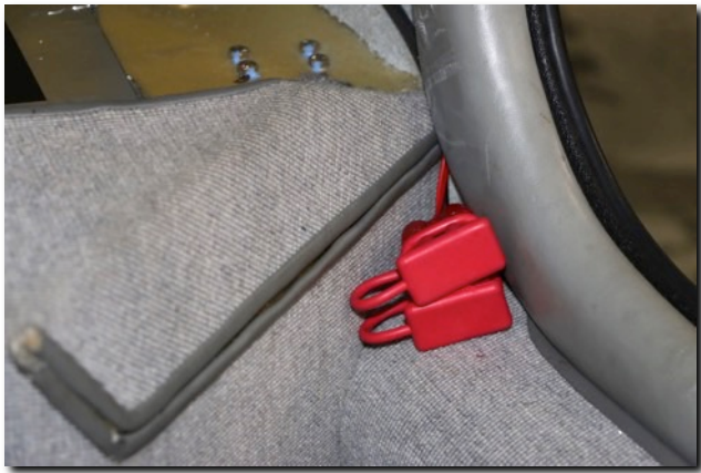
Dual battery box with separate fused charger harnesses.