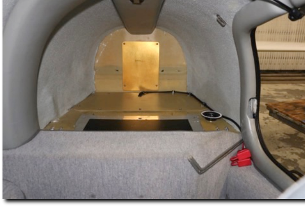
Columbia 400 aft baggage door.