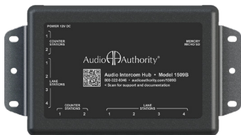
AUDIO MINI HUB MODEL 1509B