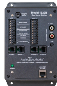
DUAL AUDIO LANE STATION MODEL 1522B