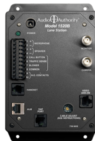
A-V LANE STATION MODEL 1520B