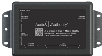
VIDEO MINI HUB MODEL 1509BV