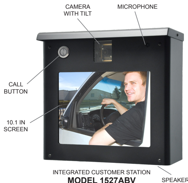
INTEGRATED CUSTOMER STATION MODEL 1527ABV