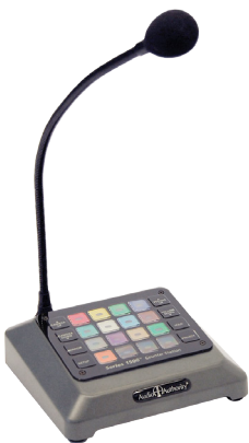
MODEL 1500A COUNTERSTATION

Using the 1550A Setup Tool, volume levels and system configuration for the entire system can be adjusted from one of the Counter Stations.