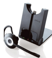
MODEL 1542J WIRELESS HEADSET