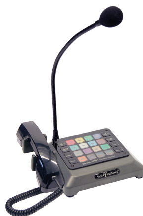
MODEL 1500AH COUNTERSTATION