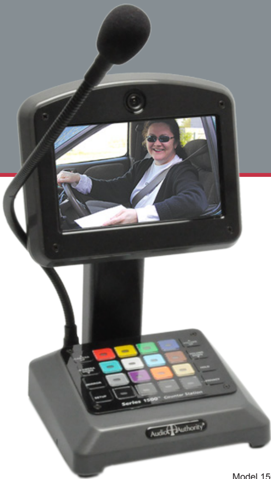
Model 1500A with 1502 video add-on.