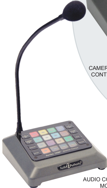
AUDIO COUNTER STATION MODEL 1500A