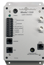
LANE STATION MODEL 1520