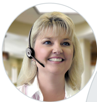
WIRELESS HEADSET OPTION MODEL 1542V