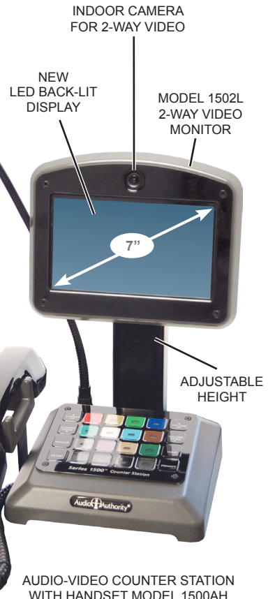
AUDIO-VIDEO COUNTER STATION WITH HANDSET MODEL 1500AH