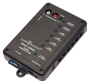
AUDIO HUB MODEL 1509SD