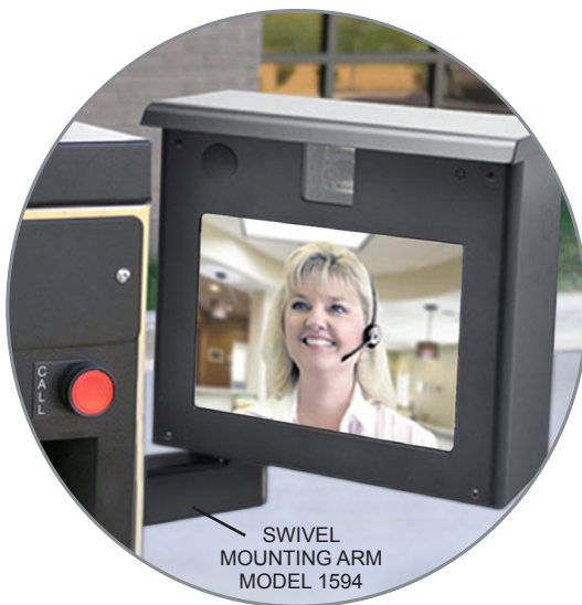
SWIVEL MOUNTING ARM MODEL 1594