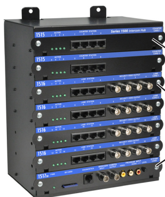
A-V SYSTEM HUB MODEL 1513A