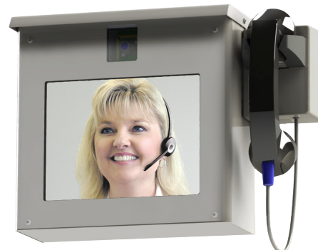
1527V with optional privacy handset

The 1526 / 1527 Series is an approach to two-way video communications that offers durable performance and economical packages. These units come in two functional packages: a basic camera and video display package for connection to a 1520 Lane Station, or an Integrated AV Customer Station that includes a call button, microphone, speaker, and all the functionality of a 1520 Lane Station. 7 inch and 10.4 inch screen sizes available. The special Pixim camera utilizes the exclusive Digital Pixel System that can render sharp details in images even with strong backlight and/or deep shadow conditions. The LED back-lit screen uses less power, and delivers bright, clear video images.