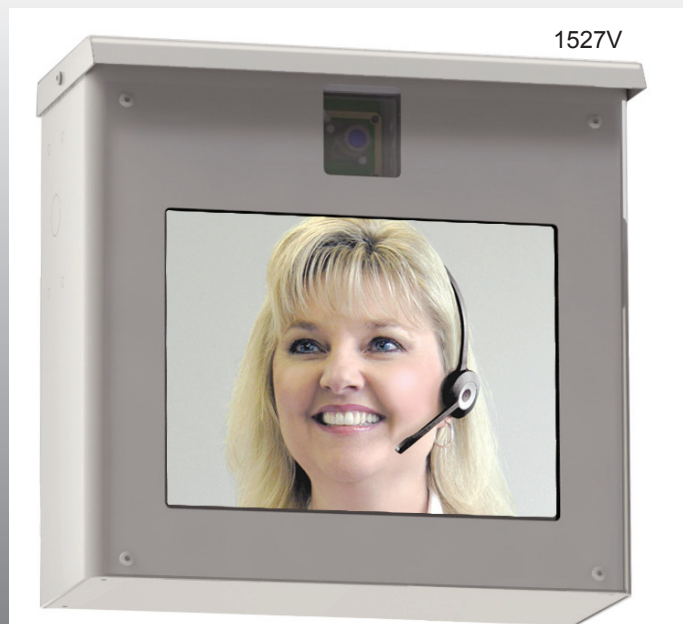
Two-way Video Display with Camera (requires 1520) Model 1527V offers two-way video including a camera and 10.4 inch display. 1526V has 7 inch screen (not shown).

The 1526 / 1527 Series is an approach to two-way video communications that offers durable performance and economical packages. These units come in two functional packages: a basic camera and video display package for connection to a 1520 Lane Station, or an Integrated AV Customer Station that includes a call button, microphone, speaker, and all the functionality of a 1520 Lane Station. 7 inch and 10.4 inch screen sizes available. The special Pixim camera utilizes the exclusive Digital Pixel System that can render sharp details in images even with strong backlight and/or deep shadow conditions. The LED back-lit screen uses less power, and delivers bright, clear video images.