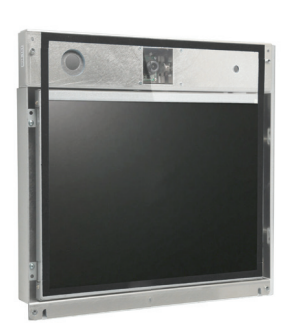
Model 1529VO 15 inch video chassis for OEM Drive-ups. Other models available with integrated call button, speaker, and microphone.

The 1527 / 1529 Series is an approach to two-way video communications that offers durable performance and economical packages. These units include a camera and video display that connect to a 1520 Lane Station with one Cat 5 cable. The special outdoor camera utilizes technology that can render sharp details in images even with strong backlight and/or deep shadow conditions. The LED back-lit screen delivers bright, clear video images with minimal power usage.