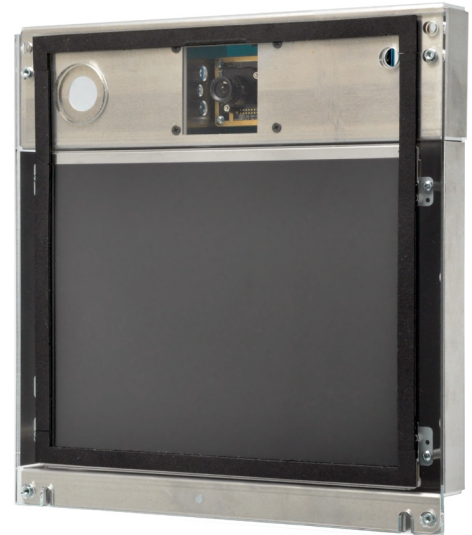
Model 1527VO 10.4 inch video chassis for OEM Drive-ups. Other models available with integrated call button, speaker, and microphone.

T he 1526 / 1527 Series is an approach to two-way video communications that offers durable performance and economical packages. These units include a camera and video display that connect to a 1520 Lane Station with one Cat 5 cable. Available in 7 inch and 10.4 inch screen sizes. The special outdoor camera utilizes technology that can render sharp details in images even with strong backlight and/or deep shadow conditions. The LED back-lit screen delivers bright, clear video images with minimal power usage.