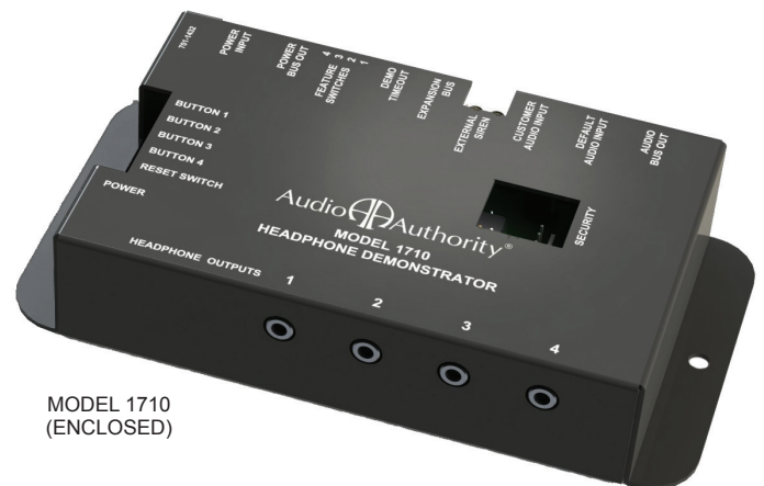
MODEL 1710 (ENCLOSED)

Optimal steel cover protects the switcher from damage and provides clear labeling for the connections.