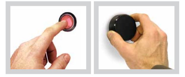
Easy to use, durable controls invite customer interaction. Volume control interface is compatible with up/down buttons or rotary encoder knob.