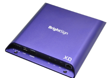
COMPATIBLE WITH BRIGHTSIGN MEDIA PLAYERS