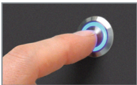
Buttons are available in several colors and styles.

This application shows a demo with a soundbar. Press the Demo button to activate the sound; the push-buttons display a blinking pattern when the demo is active. Press the volume up or down buttons to control the audio level. Press Demo to mute the soundbar, or wait until the 1799 timer mutes the volume level.