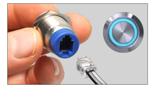
The Model 013-100 Easy Plug Push-Button with RJ9 connector for easy installation and long term reliability. Easy Plug push-buttons may be used to adjust volume and select tracks.