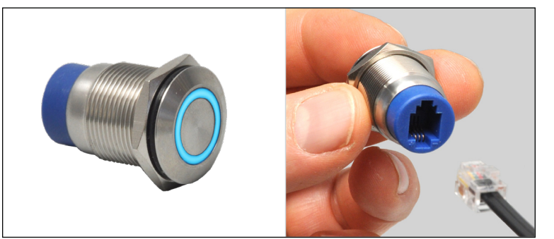
The Model 013-100 blue Easy Plug push-button with modular RJ9 connector.