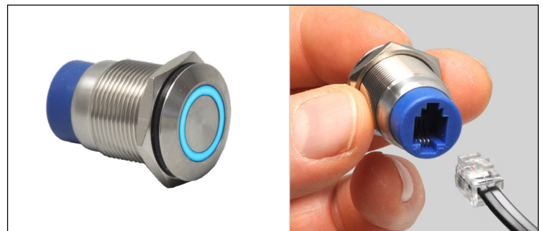
The Model 013-100 blue Easy Plug push-button with modular RJ9 connector.