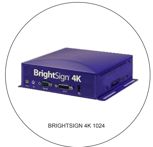
BRIGHTSIGN 4K 1024