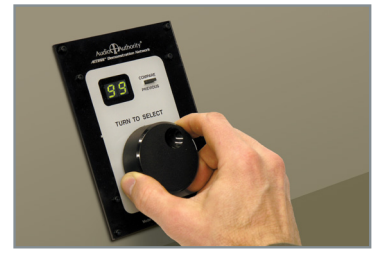
Several styles of product select buttons and control panels are available.