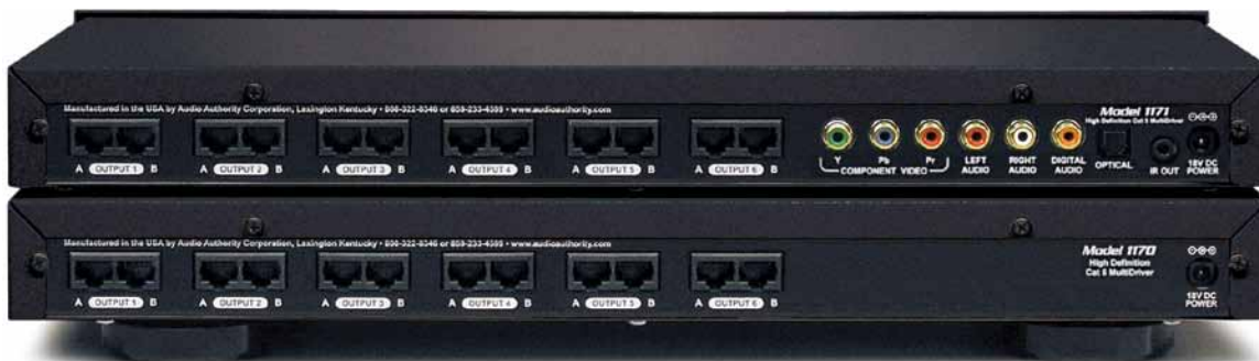
1171 rear panel

The Model AVD-71D SixDrive™ incorporates the key signal paths necessary for premium audio and video distribution systems. Consisting of an 1171 MultiDriver and six 9879 Zone Receivers, the AVD-71D system distributes component video at resolutions up to 1080p, as well as both digital and analog audio, over two inexpensive, easy-to-install Cat 5 cables from a single source to each of six outputs. 1170 MultiDriver Expanders and additional Wallplate receivers can be added to expand system capacity to a maximum of 42 zones. Audio Authority's Active Gain Equalization (AGE) technology and unique cable length compensation allows adjustment for the optimal signal strength at any distance up to 1,000 feet from the source, faithfully preserving the signal's original color and detail.