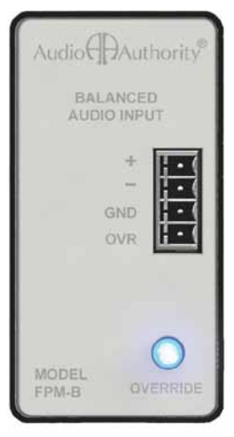
BALANCED AUDIO WITH OVERRIDE PIN