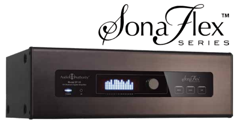
SF-16M Matrix Amplifier