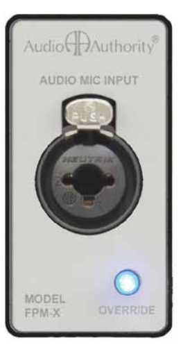
XLR / TRS MIC COMBINATION