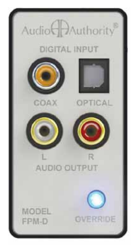
DIGITAL AUDIO WITH ANALOG OUTPUT