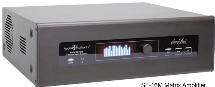
SF-16M Matrix Amplifier