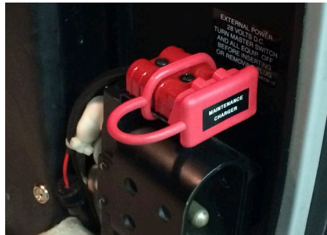
Maintenance charger plug & cover installed.