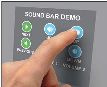
The *Model TS09 - A TouchSelect control panel may be programmed and used to adjust volume and select tracks. Contact your sales associate for more information.