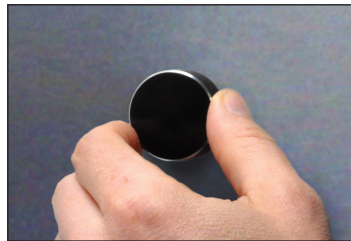
The 1894 Rotary Control knob rotates to control volume level and advances the track selection with a press. Available with a black or silver knob.