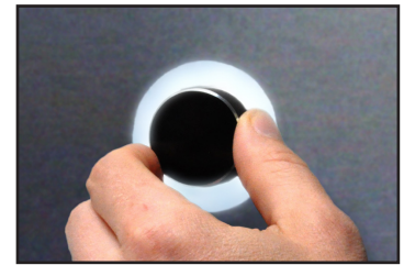
The Visual Volume™ Model 1895 Rotary Control gives visual feedback with its glow ring, its brightness indicating changes in volume; a slow pulse highlights the knob during attract mode.