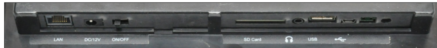
903i-A PORTS (BOTTOM REAR)