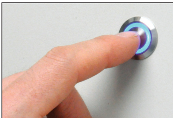
Push-buttons (4-wire or 2-wire) may be used to adjust volume and select tracks. They are available in several styles and colors; pictured above is a stainless steel button illuminated with blue LED ring.