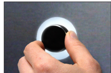
The Visual Volume™ Model 1795 Rotary Control gives visual feedback with its glow ring, its brightness indicating changes in volume; a slow pulse highlights the knob during attract mode.